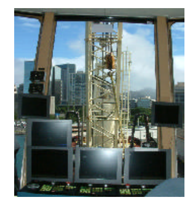
With a recent refit, Essayons now performs the work of more modern dredgers.