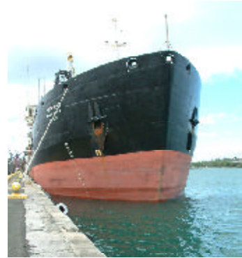
Essavons at Honolulu Pier awaiting her fresh crew to arrive from Portland Oregon.