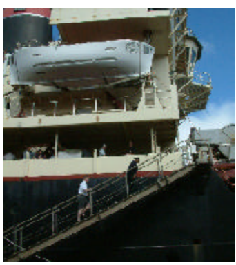
HED, POD and city employees ascend the gangplank for a tour

Vessel Speed Light - 13.8 knots Loaded - 13.5 knots