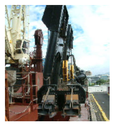
Dragarms on each side of the vessel carry away the sand or silt and deposit it in the hopper bins.

On March 18, Essayons made the eight-day journey home to Portland District where she will keep the harbors and rivers in California, Oregon and Alaska navigable until her next visit to Honolulu.